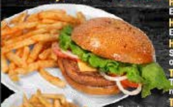
Cheeseburger & Fries