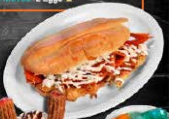
Torta de Chilaquiles