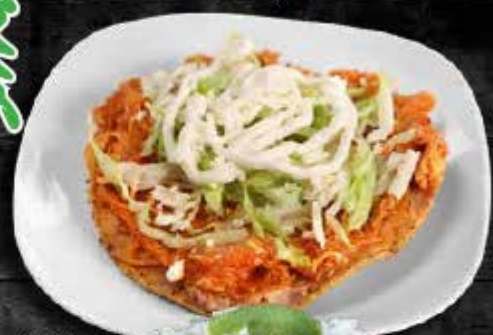
Tostada de Tinga de Pollo