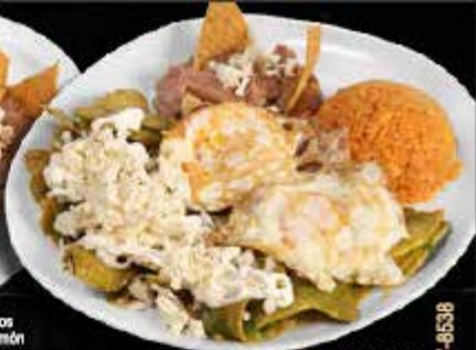
Chilaquiles Verdes Con Huevos