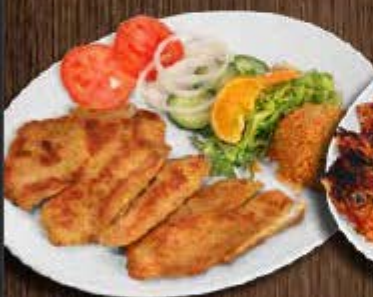
Filete de Pescado Empanizado 17 90 Served with rice and salad