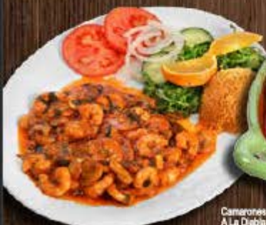
Camarones a la Diabla 18 90 Shrimp in a spicy deviled sauce, rice and salad