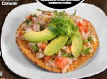
Tostada de Ceviche de Camarón