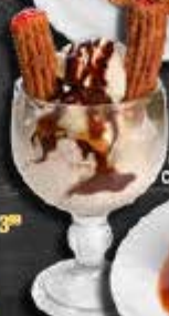
Churros Con Nieve