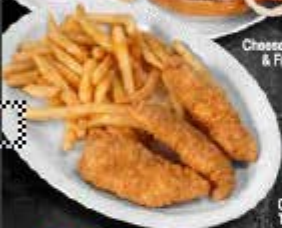
Chicken Tenders & Fries