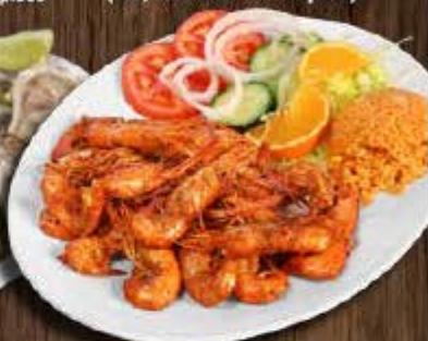
Langostinos Dinner 24 90 Prawns dinner served with rice and salad