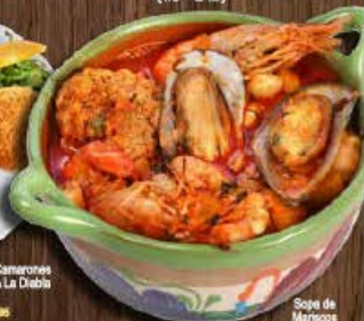
Sopa de Mariscos