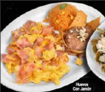
Huevos Con Jamón