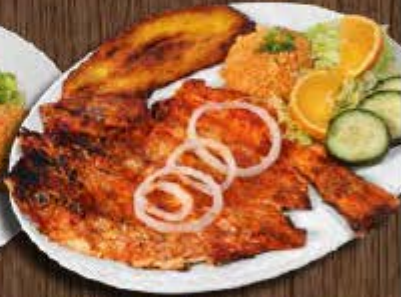
Huachinango Zarandeado 35 90 Grilled open face red snapper served with rice, salad and plantain (1.5 - 2 lb)