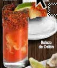
Balazo de Ostión